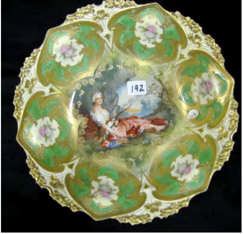
RSP 10 1/2" point and clover mold Dianna portrait bowl $1,250