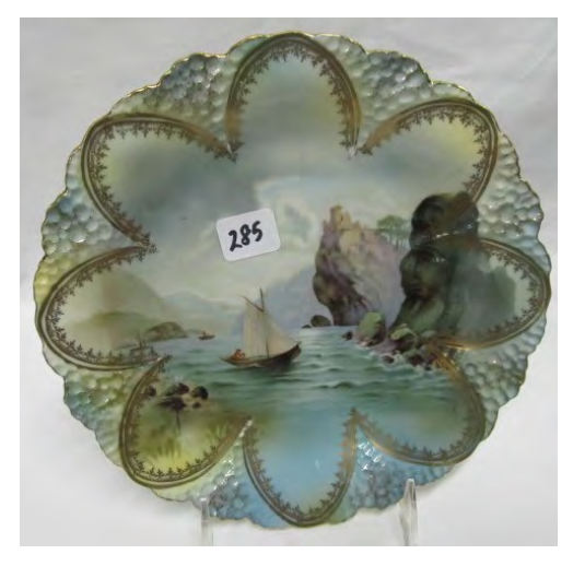
RSP 9" Man in the Mountain plate $550