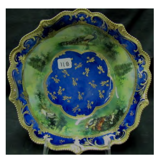
RSP 10" cobalt 3 scene barnyard bowl $2,100