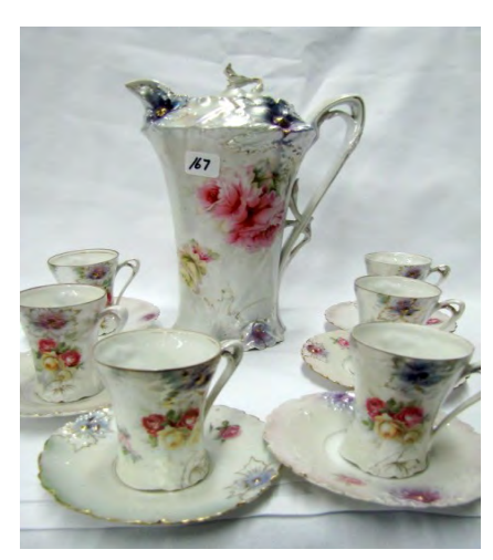
RSP carnation mold satin finish chocolate set with 6 cups and saucers $1,400