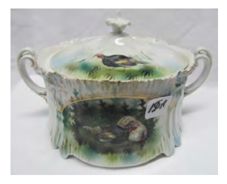
RSP icicle mold barnyard scene cracker jar $1,200