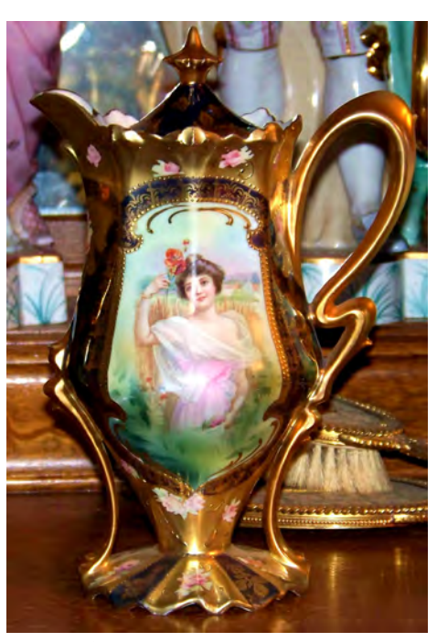
Keyhole "Summer Season" pedestal iridescent Tiffany Chocolate Pot.

The thrill of the hunt and the discovery are still with us! Enjoy!