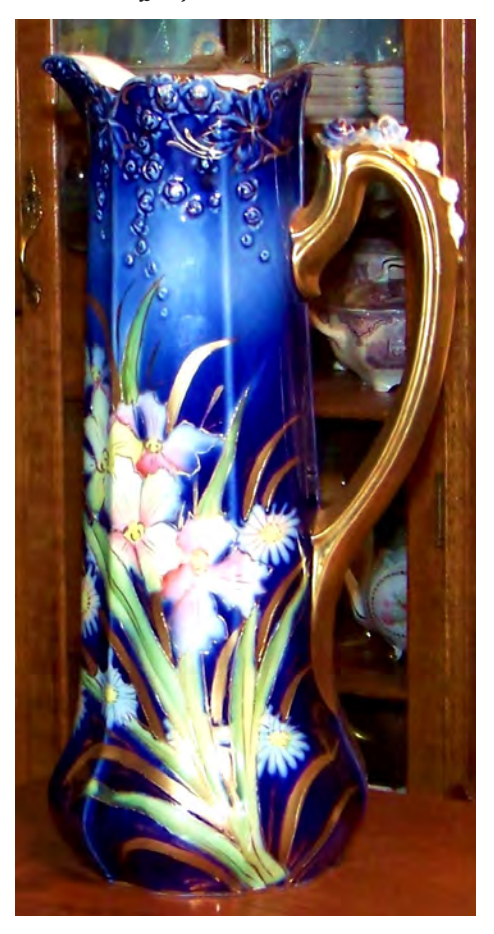
15" Cobalt Rosebud mold floral tankard.