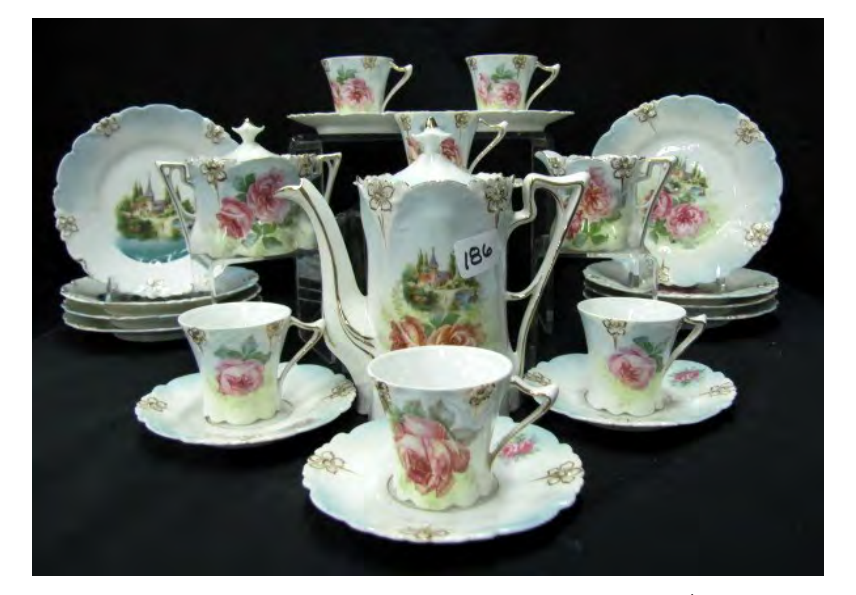
UM RSP lily mold castle scene and roses child's tea set $1,400