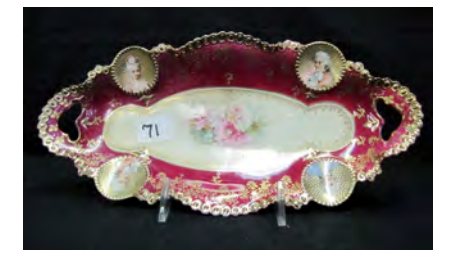
RSP 9" colonial people portrait medallion relish with red trim $450