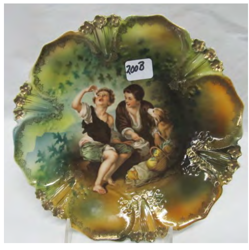
RSP 8 1/2" violet mold melon eater plate $275