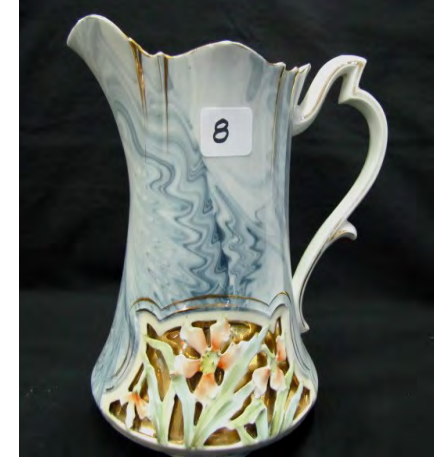
UM RSP 9" reticulated cider pitcher with marble background $575